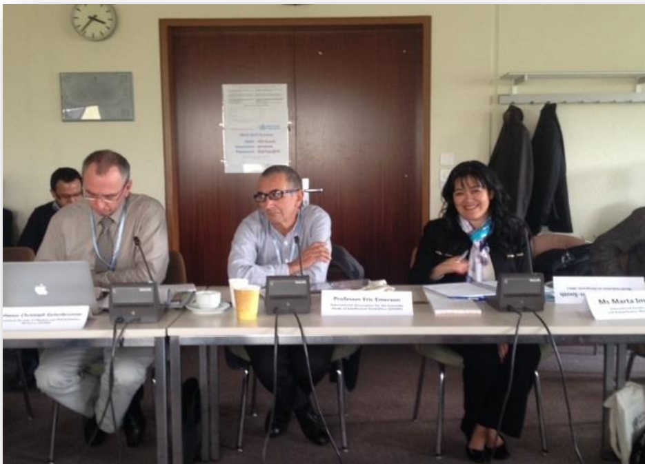
Meeting in advance of the World Health Assembly in Geneva to discuss the Disability Action Plan