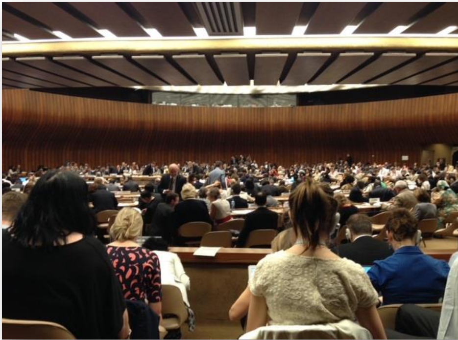
The World Health Assembly in Geneva, Switzerland