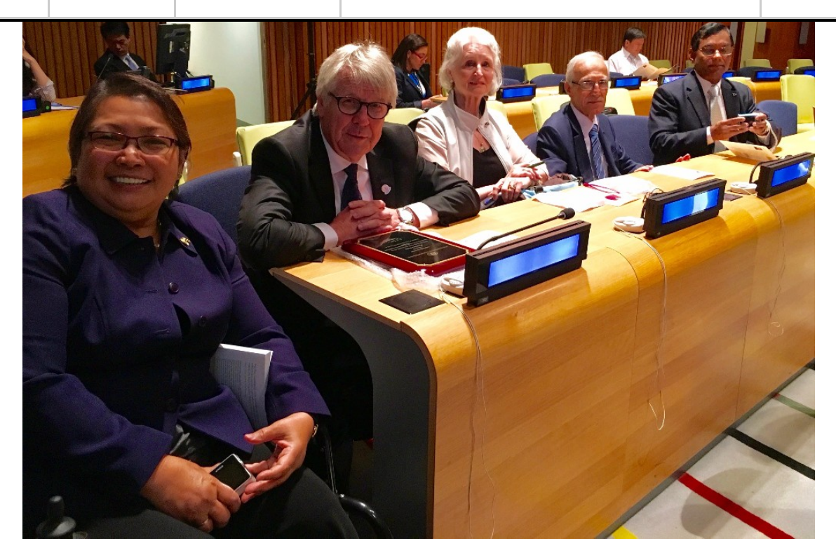
Members of RI Global's Executive Board meet at the United Nations.