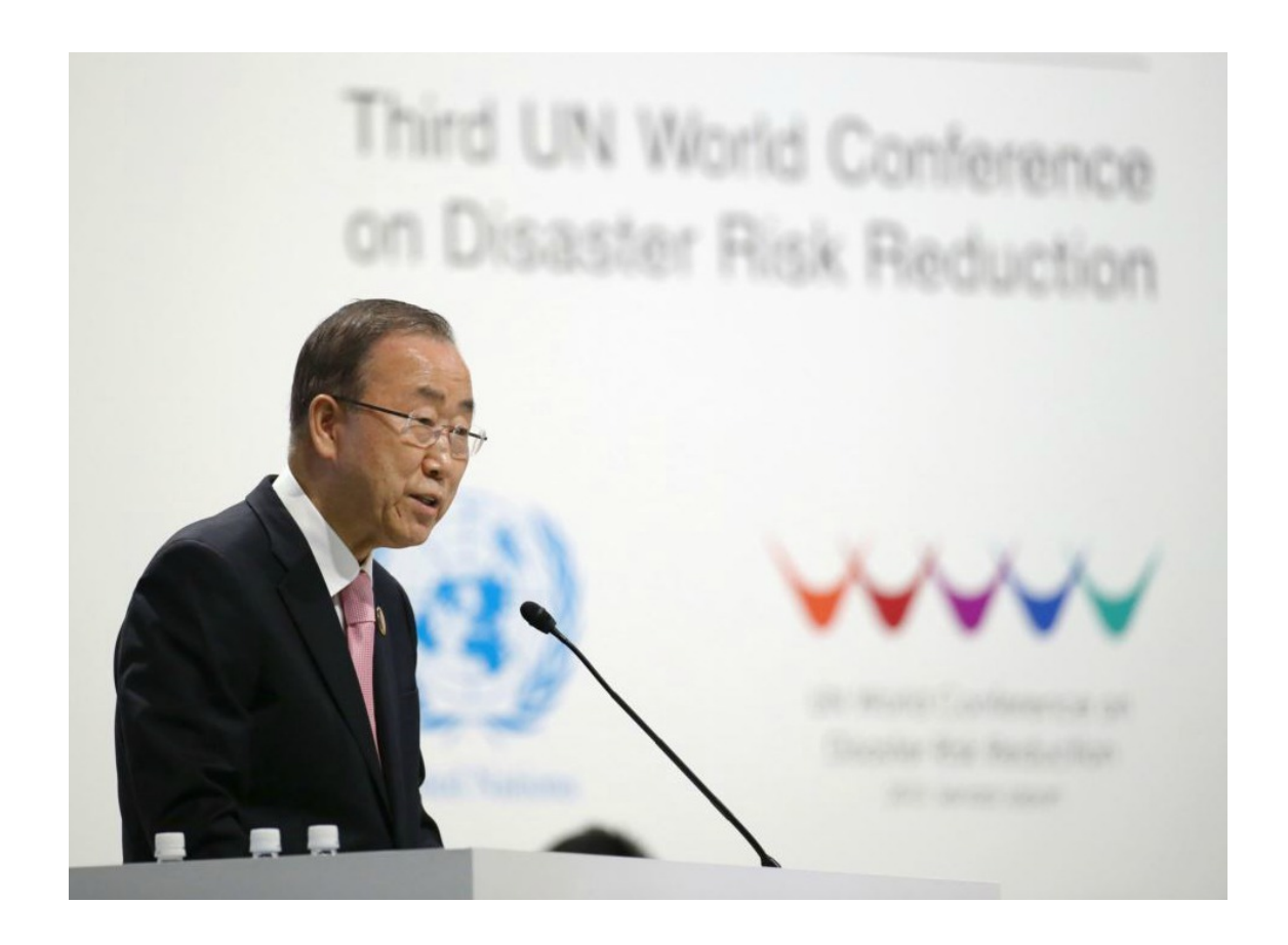
COMMISSION HIGHLIGHT — RI Global launches Sendai Framework: A new framework on Disability Inclusive Disaster Risk Reduction (DiDRR) was officially adopted on 18 March 2015 at the Third United Nations World Conference on

RI Global's Commission on Policy and Service identifies new policies and programs in each of the world's geographic regions and analyses the ways in which these developments align with the implementation of the UN CRPD. Once per year, the Commission also organizes outreach at the National Rehabilitation Conference in Helsinki, one of the most important training and networking events for rehabilitation practitioners. In 2014 the conference focused on rehabilitation among children and young adults and their transition to work, with papers presented on challenges for disabled young people; in 2015, plenary sessions concentrated on return to work practices in various European countries.